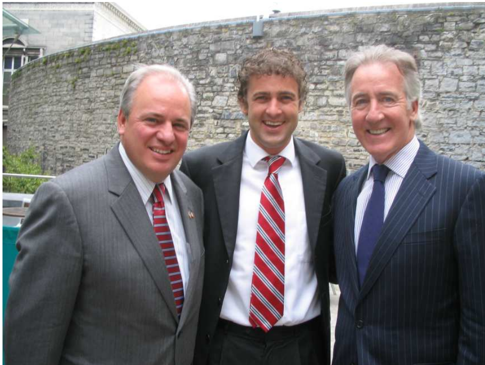
Senator Mark Daly with Pennsylvania Congressman Mike Doyle and Massachusetts Congressman Richie Neal

Senator Mark Daly met with Congressman Richie Neal, whose family hails from Dingle, and leaders of the "Friends of Ireland" US Congressional Delegation, Tuesday 30 June 2009, as part of bi-lateral talks between the US and Irish Parliamentary Delegations.