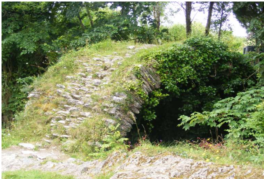
Cromwell's Bridge, an important local heritage site in Kenmare

When I initially spoke to Kerry County Council about taking ownership of the unique Cromwell's Bridge they told me that they did not have the capacity to maintain it and therefore would not take charge of it.